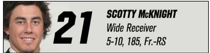
21 SCOTTY McKNIGHT Wide Receiver 5-10, 185, Fr.-RS